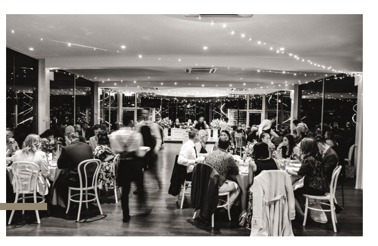
*MINIMUM NUMBERS APPLY

Canopy of Fairy lights across the ceiling