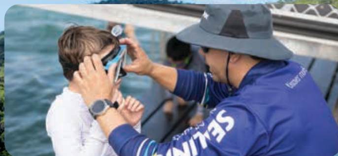
Yanks Jetty, Orpheus Island