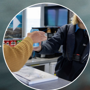
On board café & bar facilities