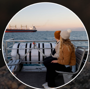
Spacious outdoor decks