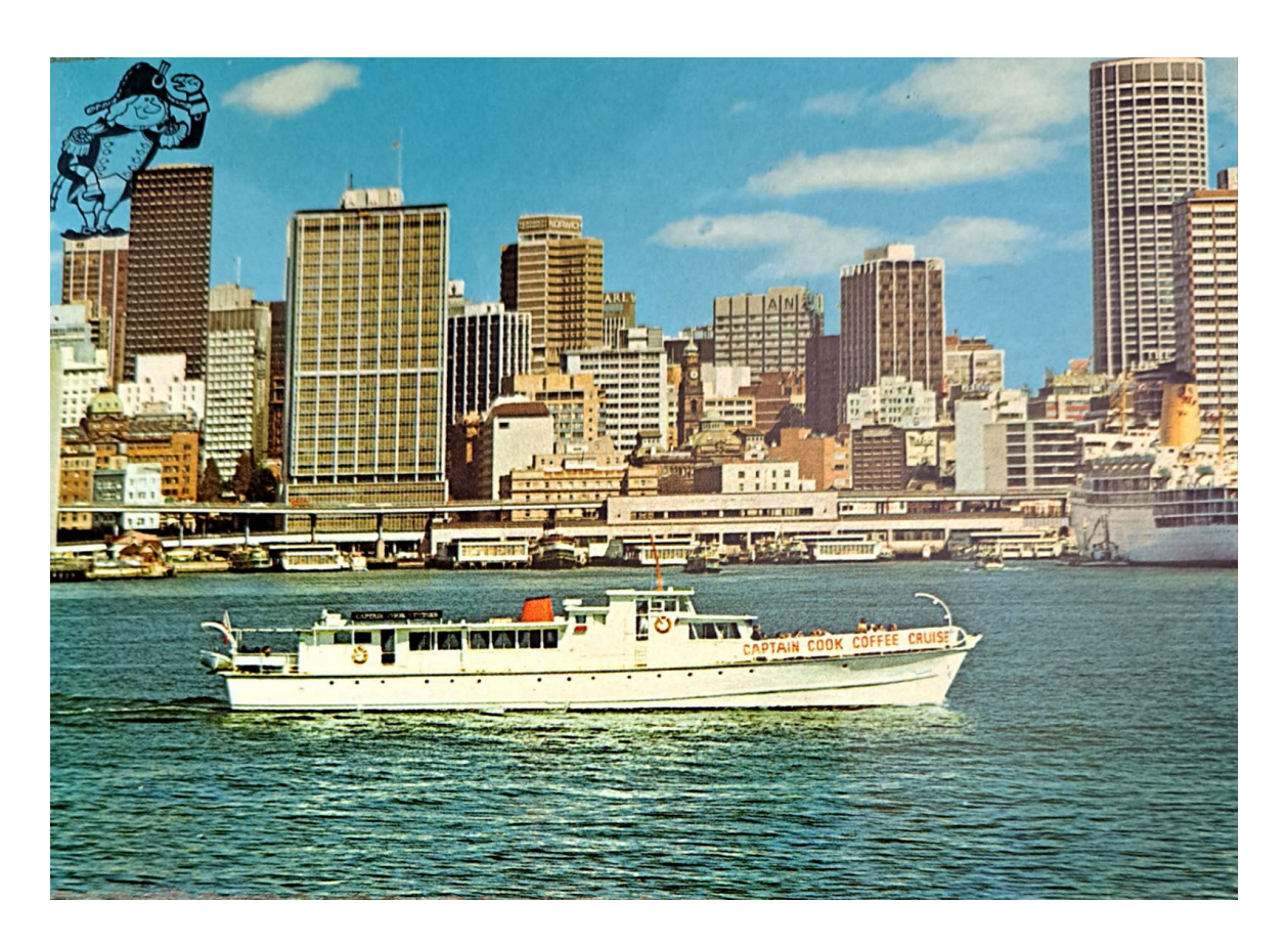
'Captain Cook 1'-1972 in Circular Quay