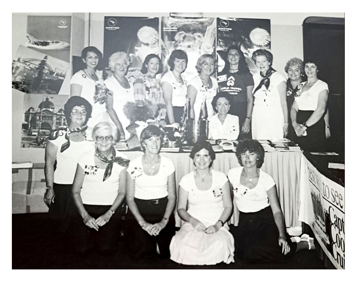
USA Roadshow 1975