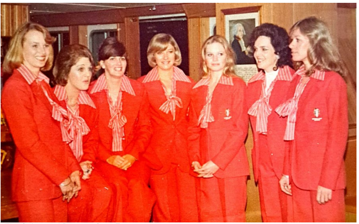
The Sales and Reservations Team, 1973.